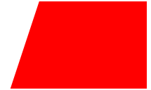
Chart 1. Vertical Segregation